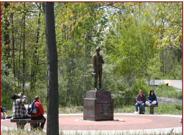
Above - The Tunnel Memorial sits directly above the tunnel and the miner looks out towards Lake Huron. The granite block below the miner is engraved with the names of the victims of the accident.